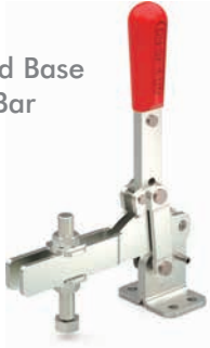
229 Flanged Base Open Bar