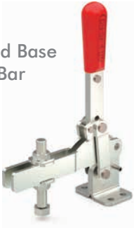
229 Flanged Base Open Bar